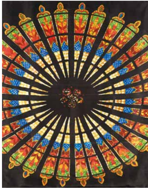
Stained glass Rose window, Strasbourg Cathedral Interior 93 x 120 cms