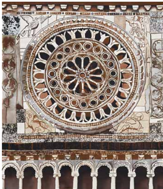
Piedra 93 x 109 cms

Jusi is the Chinese word for "raw silk" and is the term used for the unique fabric woven in the Philippines from silk and pineapple fibers. When embroidered, Jusi is the material used for Philippine formal wear for both men and women. By using it as her medium, Gonzalez pays tribute to Philippine material prima and explores other non-traditional uses for Jusi .