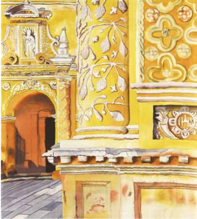
Antigua 93 x 127 cms