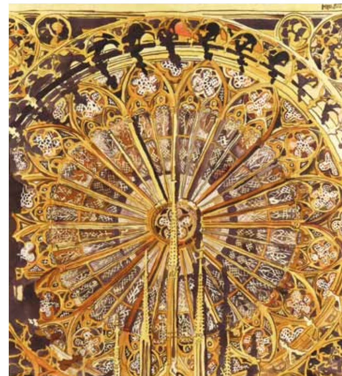
Rose window, Strasbourg Cathedral Exterior 93 x 104 cms

From the collection: « The Road to Silence »